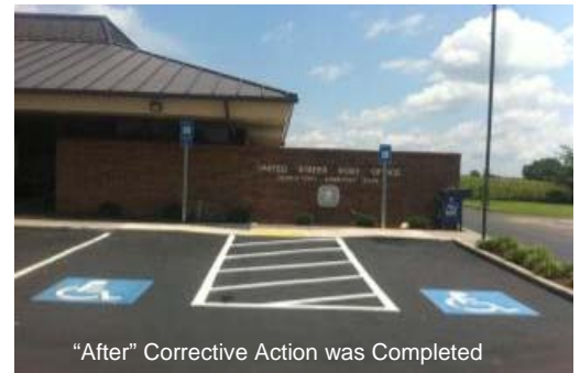
"After" Corrective Action was Completed