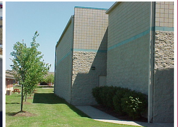
Roof Systems | Parking Lots | Rooftop HVAC | Building Facades