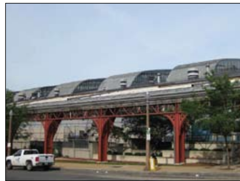
Jones Lang LaSalle Union Station Train Shed St. Louis, MO

Performed water test on the roof and façade to resolve recurring water infiltration problems at similarly designed banking facilities. A report with photos illustrating conditions and giving overall recommendations was provided.