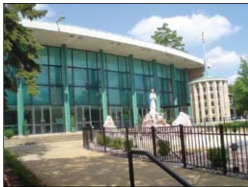
Archdiocese of St. Louis Resurrection of our Lord Church St. Louis, MO

Performed on-site evaluation of the roof conditions, developed design, coordinated bidding, and will monitor 8-section 22,000 sq' project. Construction documents by Formation Architects.