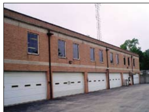
City of Kirkwood, MO Police Station Kirkwood, MO

Provided support to project architect for detailing and specification of roof design for 79,000 sq' academic building on the SIU Carbondale campus. Performed on-site review of roof system / building components.