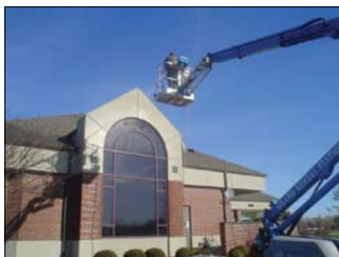
Holland Construction Bank of Edwardsville 3 metro-east locations

Performed evaluations at 13 schools and, working within the district's budget, designed and managed renovations at nine schools, coordinating two contractors. The scope of work varied widely at each location.