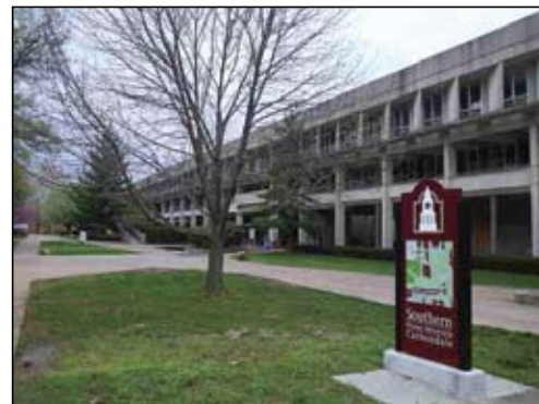
White & Borgognoni Architects SIU Faner Hall Carbondale, IL

Sub-consultant to Formation Architects on reroofing project on unique barrel roof at landmark historic building. Provided design assistance, contract administration, quality assurance and punch list.