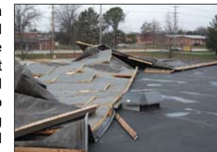
Wind damaged EPDM roof system over Center for Creative Learning - Ellisville, MO

High winds on December 10th tore off a portion of the roof system at Rockwood School District - Center for Creative Learning in Ellisville MO. Foresight went to the site the next day and provided guidance to the local roofing contractor to get a temporary roof in place by utilizing the existing membrane. The decking and structure integrity was verified, and cause of the roof system failure was determined. A permanent roof solution was designed and we provided a Scope of Work to the contractor. The project will be monitored during construction, once our mid-west weather allows, and we will perform a punch list inspection to insure a quality installation. The project is expected to be complete soon, with properly adhered EPDM and perimeter metal.