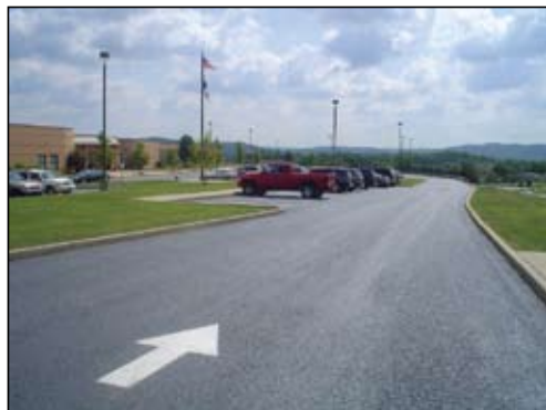
Rockwood School District 2009 Parking Lot Renovations St. Louis County, MO

Performed on-site evaluation of the roof conditions, developed design, coordinated bidding, and will monitor 8-section 22,000 sq' project. Construction documents by Formation Architects.